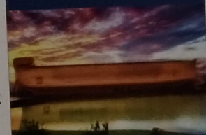
Enjoy a visit to the Famous Ark Encounter!