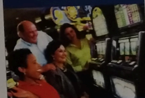
Give Lady Luck a Spin!