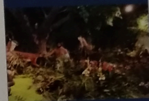
Visit to the Amazing Creation Museum!