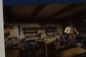
View from Inside the Ark Encounter