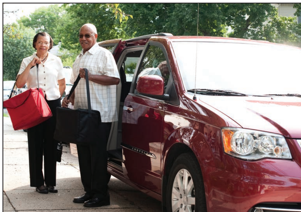
Senior Suppers are delivered daily by caring community volunteers. The meals are made with fresh, quality ingredients and are served hot to homebound seniors.

The meal program was recently recognized by the Enterprise Rent-A-Car Foundation, which awarded SCS with a six-year $25,000 grant to help combat food insecurity. The grant is part of Enterprise's $60 million global initiative to fight hunger.