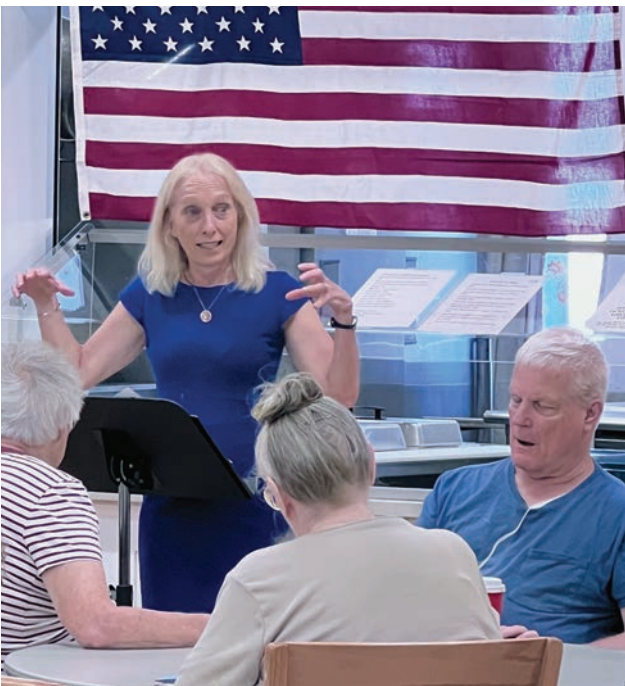
Congresswoman Mary Gay Scanlon spoke to a group of roughly 45 men and women aged 50 and above at a town hall on August 31 at Schoolhouse Center.