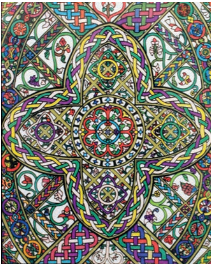
Tricia McMullin, a drawing student at Schoolhouse Center, created this intricate, colorful drawing of Celtic symbols for the show.